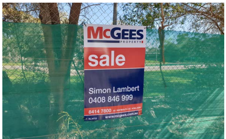
Photo of the agents sale sign on the swimming pool fence