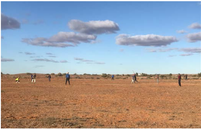
The cricket match on the Saturday with Farina versing the rest of the world. Farina emerged as the winners on the day