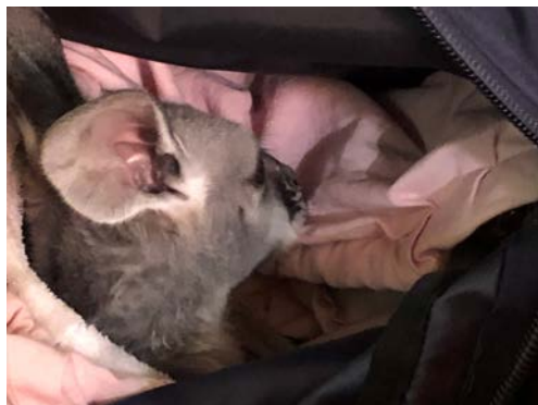
One of our smaller attendees at the June Community Meeting