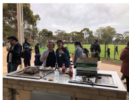
Celebration Community BBQ after the Akurra Trail opening