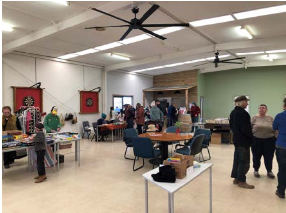
The first of what promises to be many - the Copley Market was held on the last Saturday in June