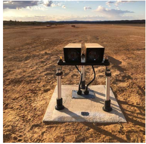
The old TVASIS (Visual Approach Slope Indicator System) and the new PAPI (Precision Approach Path Indicator)

Infrastructure upgrades have continued to take place at the Leigh Creek Aerodrome over the last few months with the replacement of the old TVASIS system to the new PAPI system, pictured above. A new electric gate has also been installed to assist with security and access for both emergency crews and essential service providers. You may recognise some of the crew pictured below as past Leigh Creek residents (Brendon Harris and Phil May). New LED obstacle and rotating beacon lighting have also been installed. The next stage is for a flight test to be undertaken then all the new infrastructure will be fully operational.